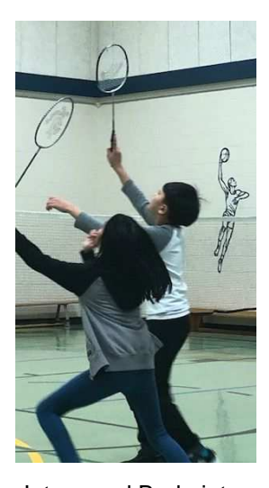
Intramural Badminton Tournament