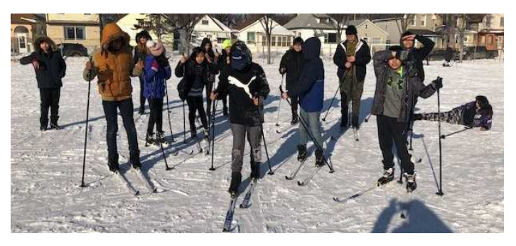
Students cross-country skiing for a variety of athletics.