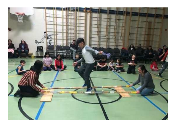
Community Family Dance