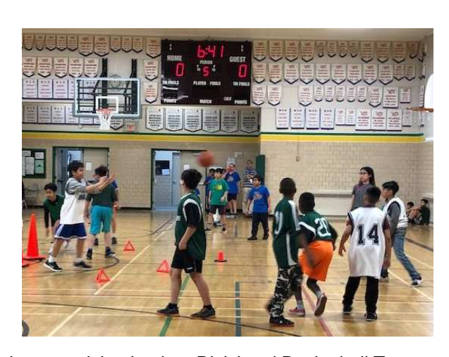
Students participating in a Divisional Basketball Tournament