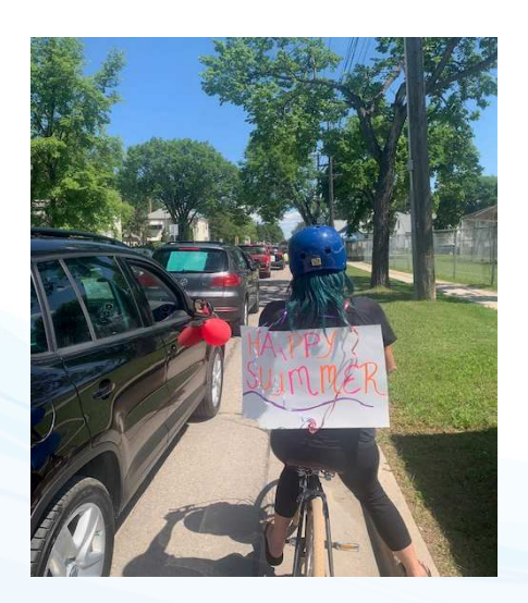
Year End Parade