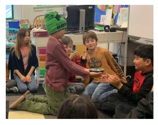
Smudging in Room 7