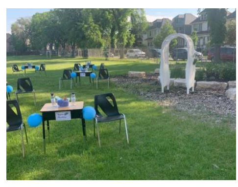
Grade 6 Farewell

We still managed to have a successful Grade 6 Farewell for our students reflecting Public Health measures such a maximum gathering size of 50 and social distancing measures.